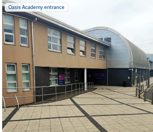
Oasis Academy entrance