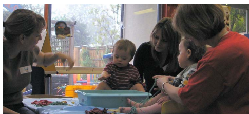
Above: Me and my son at the charity. Below: Years later sailing. The charity keeps in touch and once a year they invite everybody who's ever been to any of their classes on a day out.

This extra office space has a really big impact on the place. At the time when we were putting the application forward there was no COVID around and no social distancing. Now they really need this office space to help them function in the climate we're in. It has actually become even more important than it was before. I am so glad that I chose to sponsor the charity, and I would encourage anybody at VINCI to do it. If you've got some charity that you really are passionate about and is benefitting the community, it's really worthwhile for both parties.